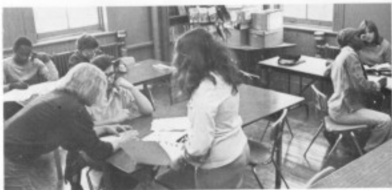
Working in the English Lab.