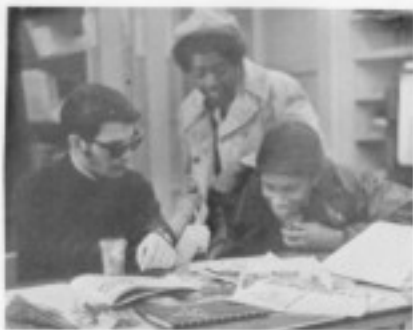
Where did you get this dirty book from?