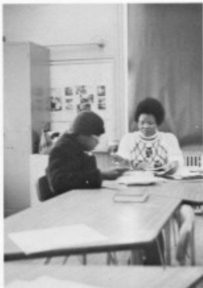
I guess you might need more than new glasses.