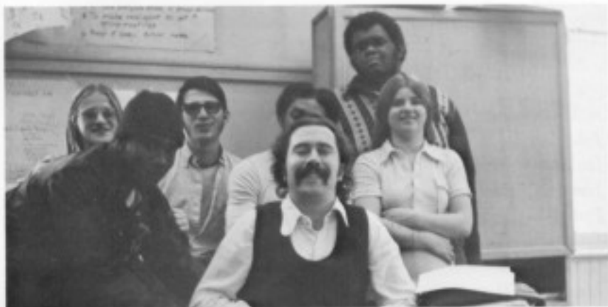
Smiling faces don't always tell the truth.