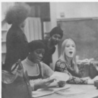
I really don't believe it myself.

Look at them all work! This can't be Street Academy.