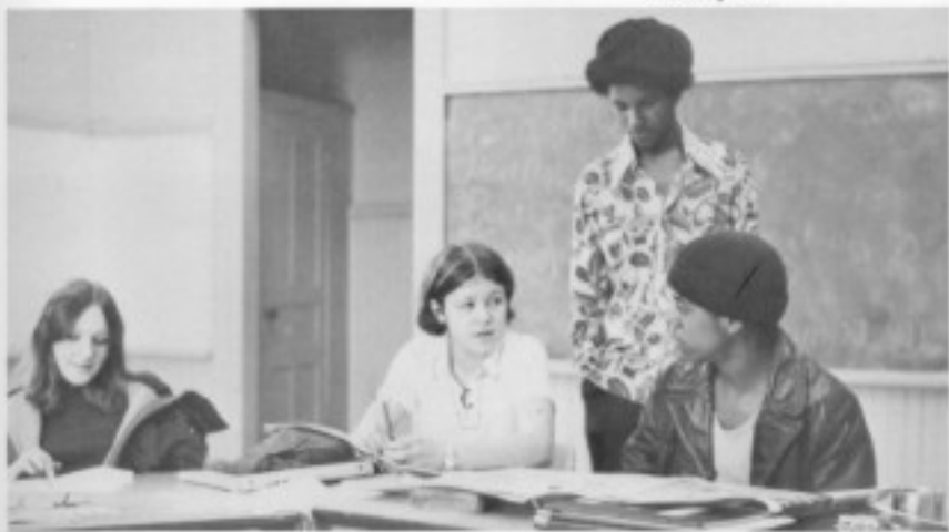
Seriously . . .