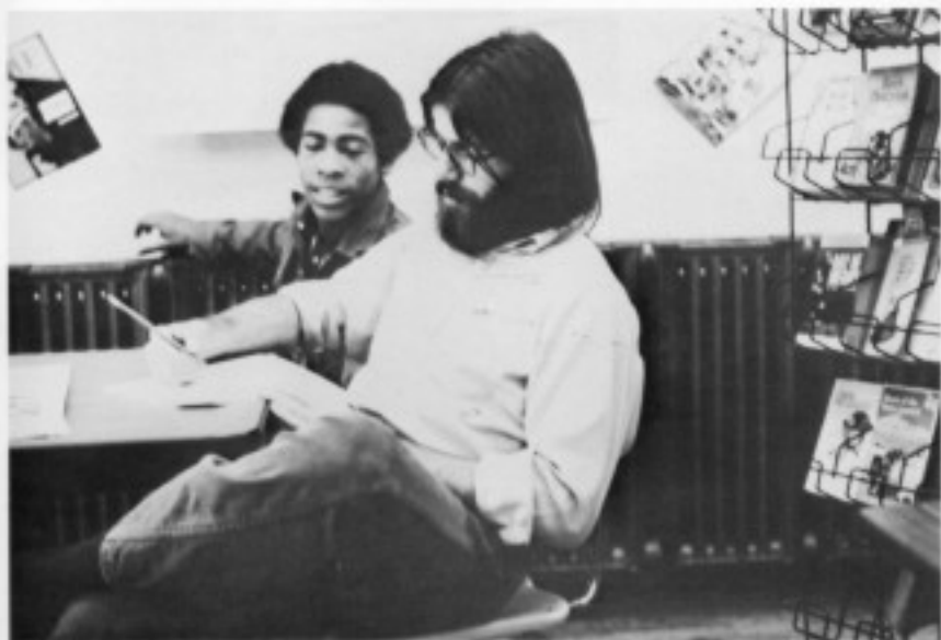
Is this for real?