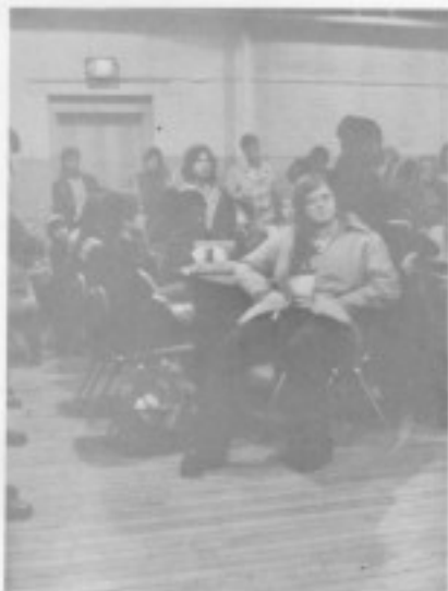
Well, get on with it . . .