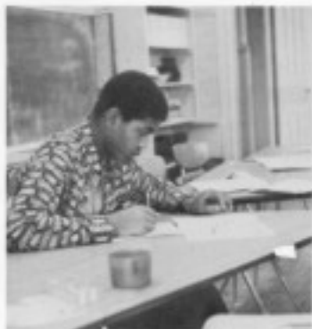
A rare moment!