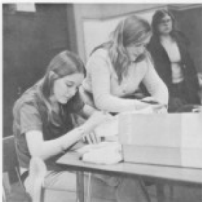
They're at it again.