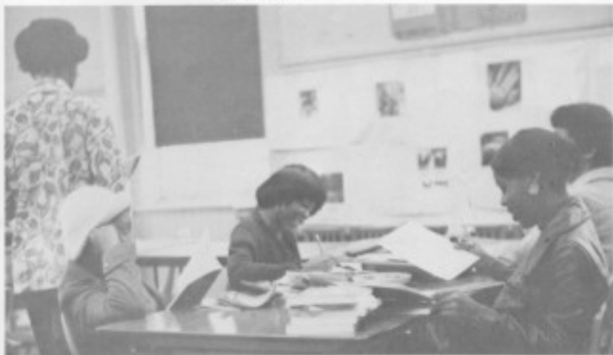
See Harvey trying to get into every picture.