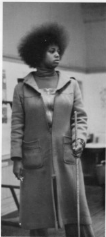
We're taking over this school starting with the principal's office!