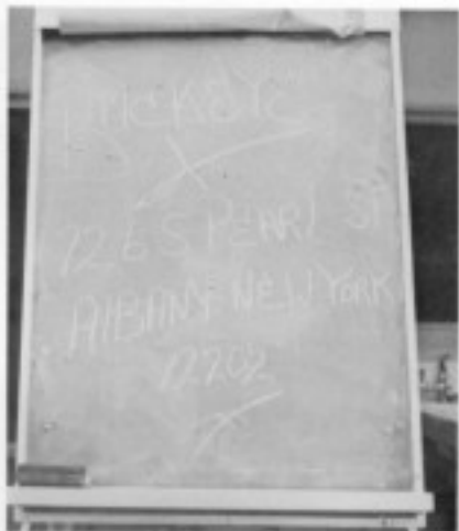
I'll show you some Kung Fu!