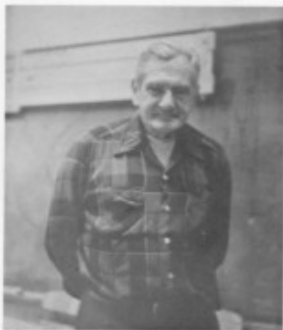
"Warm enough for you in here, bud?"