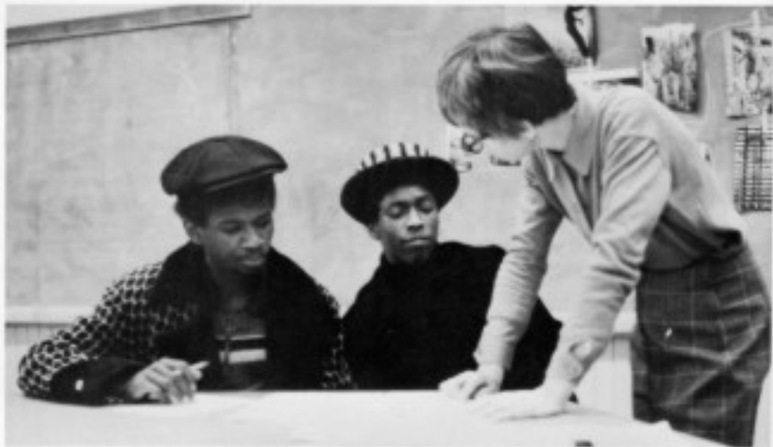
Oh, so that's how it is!