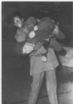
It's a bird It's a plane It's a PIGEON Wally and Jerome