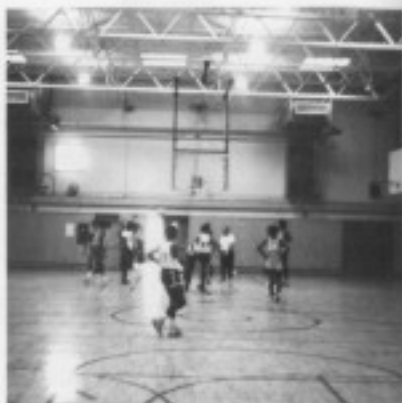
The team on defense.