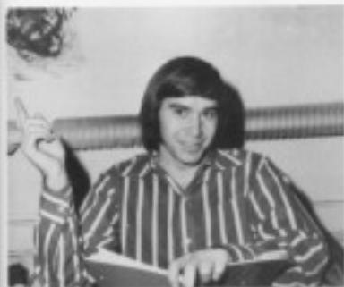
"It must have been the shutter again."