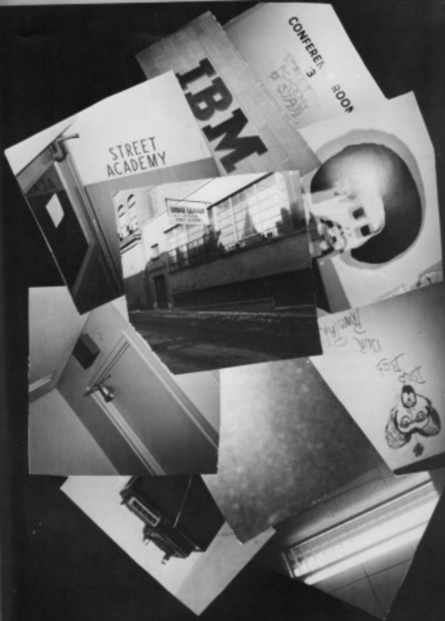
1971-72 Street Academy Yearbook