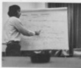
FRED ROOT English